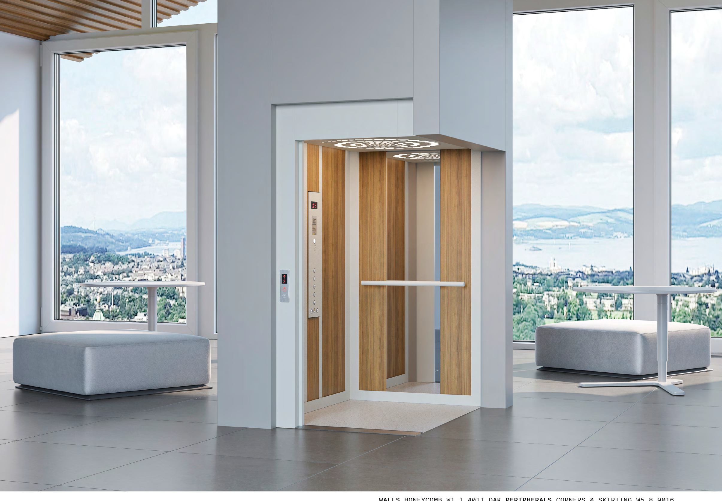
WALLS HONEYCOMB W1.1 4011 OAK PERIPHERALS CORNERS & SKIRTING W5.8 9016 TRAFFIC WHITE / FALSE CEILING A8.6 FC6 W5.8 9016 TRAFFIC WHITE / HANDRAIL A5.2 HR3 W5.8 9016 TRAFFIC WHITE / FLOOR F4.1 190 STARLIGHT WHITE