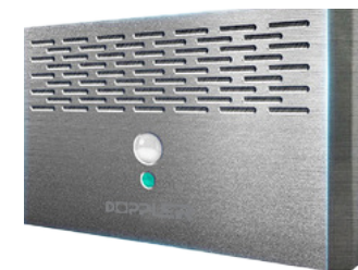
| The Air Purifier device

A disinfection system using an UltraViolet (UV) lamp, located in the elevator ceiling, that sterilizes the surfaces efficiently at 99%.