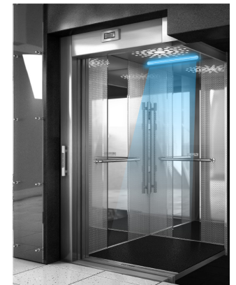
| The UV Antibacterial light